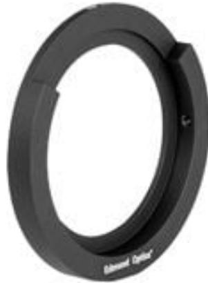
Iris Mount for 70mm Outer Diameter Irises, #53-921

Iris Diaphragm Mounts는 가장 많이 애용되는 사이즈의 당사 Iris Diaphragms 와 딱맞는 제품이며, 내구성 있는 black anodized aluminum 구조로 되어있습니다. 이 mount는 다양한 English post mounting 옵션을 특징으로 하고, 제품마다 포함된 고정 나사를 활용해 안전하게 고정할 수 있습니다.